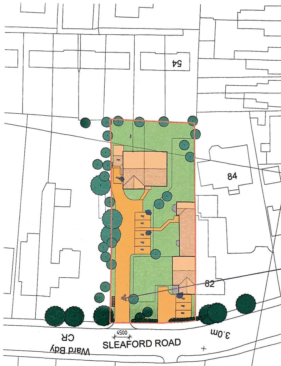
SITE PLAN (1:500)